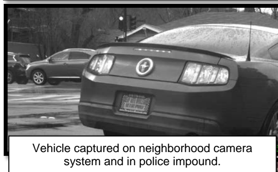
Vehicle captured on neighborhood camera system and in police impound.