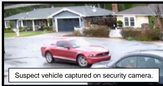
Suspect vehicle captured on security camera.

LPD Investigators were then able to identify the license plate number and registered owner of the vehicle. Investigators determined the vehicle was actually in police impound following an incident in Solano County. The vehicle had been impounded by CHP Officers in the early morning hours of 2/4/17. The driver of the vehicle was identified by CHP Officers and released. LPD Investigators responded to the storage facility, verifying this was the same vehicle used in the Lafayette crime. Investigators also found property from the burglary within the vehicle.