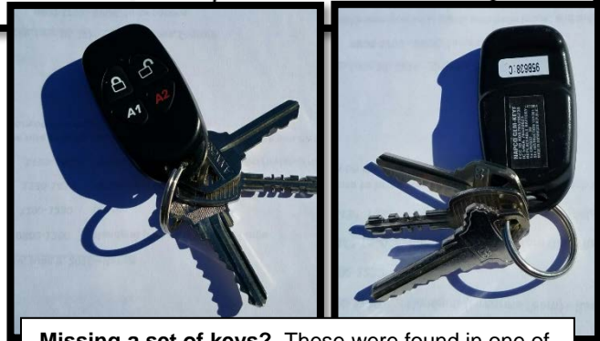
Missing a set of keys? These were found in one of the homes, left by the suspect(s).

3100 Block of Rohrer Drive - A neighbor who was walking found a man's wallet laying in the roadway of Cordova Way. The resident searched the wallet and found that it belonged to a resident on Rohrer Drive. They return the wallet to the owner and discover the wallet was taken from an unlocked vehicle in the driveway of the home. The resident was unaware their wallet had been taken from the vehicle. The vehicle was unlocked in the driveway of the home overnight. The wallet was likely taken from the vehicle between 10 p.m. and 4:30 a.m.