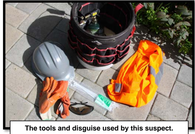
The tools and disguise used by this suspect.

Nixle Alerts. Residents who have not yet subscribed are urged to subscribe to our alerting system that we perform through the Nixle Alerting System. For significant incidents and disasters within the community, this is the primary system that will be used to provide our residents with information about incidents such as this one. You can subscribe to Nixle Alerts by visiting the Nixle Website ( www.nixle.com ) - a free service for our residents.