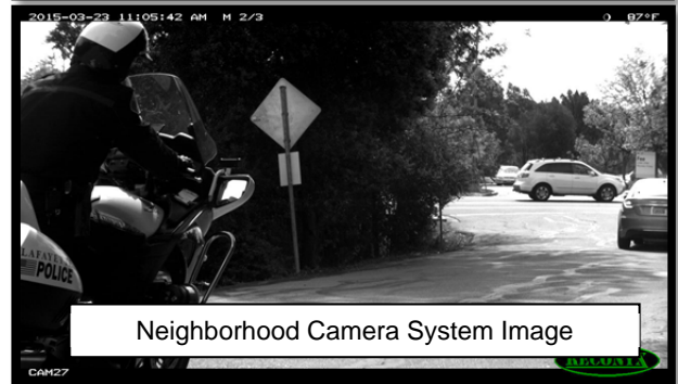
Neighborhood Camera System Image