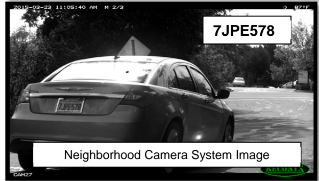
Neighborhood Camera System Image