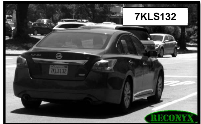
The suspect vehicle was captured on a neighborhood camera system near the crime scene.

On Wednesday, 6/17/15, our investigators were notified that officers from the Oakland Police Department had located the vehicle. During an enforcement stop, the wanted suspect was found inside the car. Our investigators and officers responded to Oakland, returning to Lafayette with both the suspect and his vehicle. The suspect was interviewed by investigators and his vehicle processed by our Crime Scene Investigators (CSI). The suspect was later booked at the jail for attempted burglary and the car was sent to storage. Our investigators have now identified the second suspect in this case.