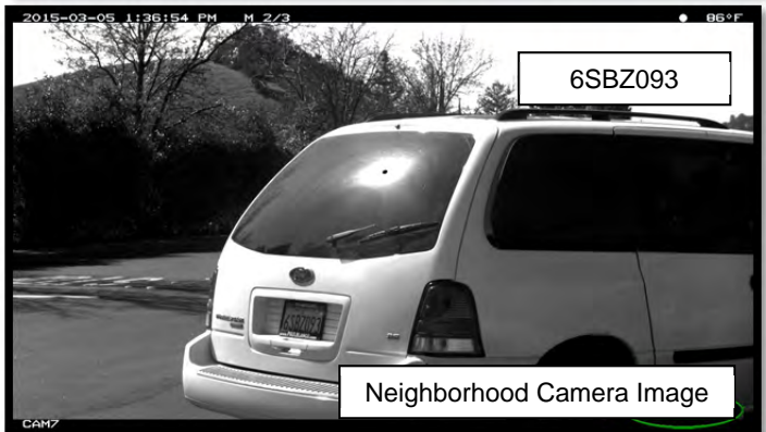
Neighborhood Camera Image