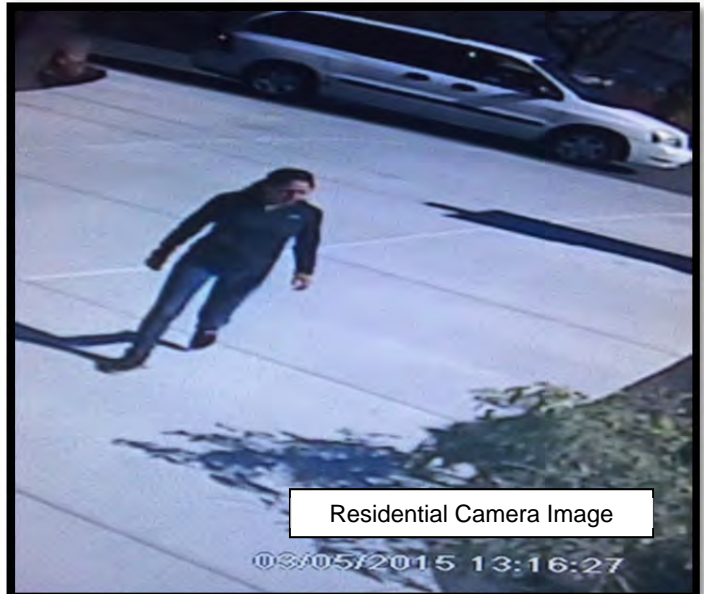
Residential Camera Image