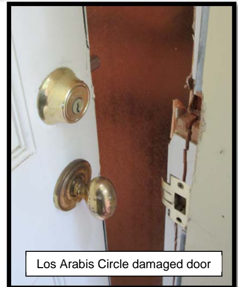
Los Arabis Circle damaged door

FRI (2/6/15) Green Valley Court (Reported at 1806 hrs.) (Residential Burglary) - Resident returns home and finds a rear glass door of the home shattered and the interior of the home searched. The suspects appear to have taken several items of property, but were unable to find any jewelry within the home. This neighborhood is protected by a community camera system. A review of this system provided a strong lead on the identity of the suspects who committed the burglary. (DR # 15-2164)