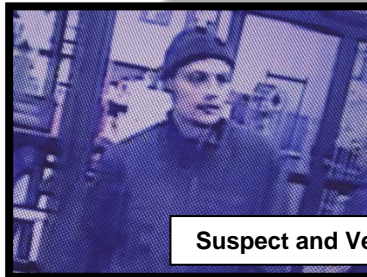
Suspect and Vehicle in Antioch Store