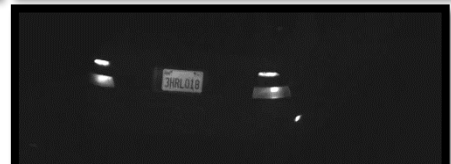
Suspect vehicle leaving Lafayette at 4:17 a.m. after the burglary.